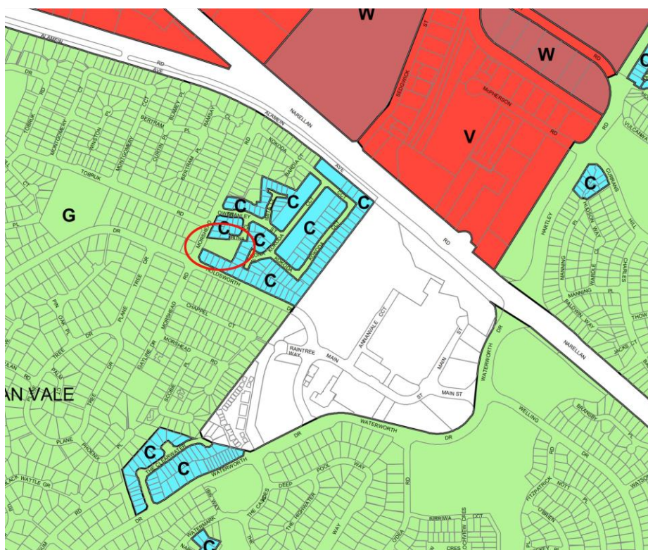
Figure 14 – Existing minimum lot size map extract (Location Highlighted)