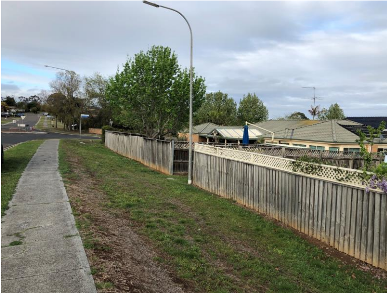
Figure 7 – Land on opposite side of Morshead Road (West)

The land to the immediate west (western side of Morshead Road) comprises traditional dwellings (Refer to Figures 7 and 8) on land zoned R2 – Low Density Residential with a 450 sq.m minimum lot size.