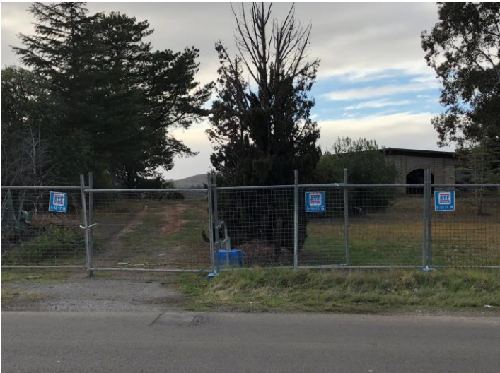
Figure 3 – Site viewed from Morshead