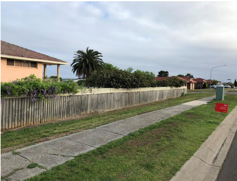
Figure 8 – Land on opposite side of Morshead Road (West)