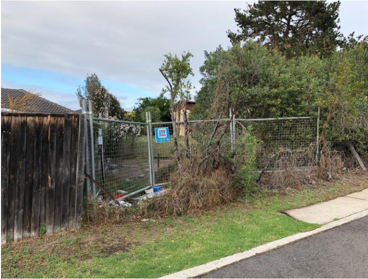
Figure 5 – Site taken from rear of Bunya Place