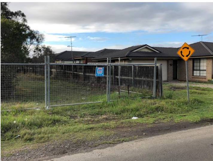
Figure 4 – Site viewed from Morshead Road