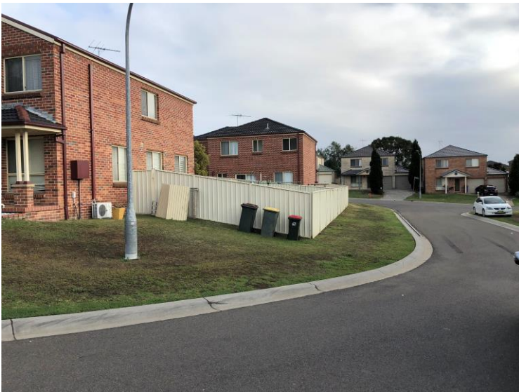
Figure 10 – Bunya Place looking toward Owen Stanley Street