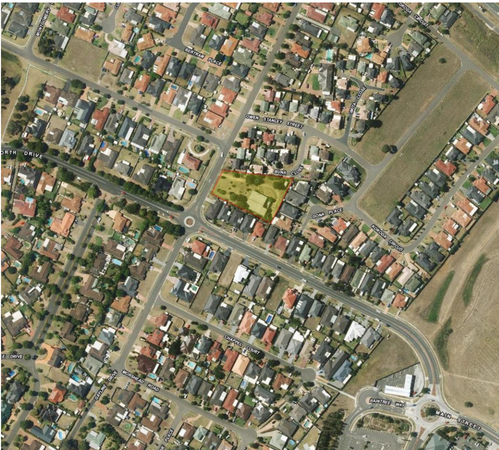
Figure 6: Immediate Locality/Context

The site is located in an area subdivided and developed for residential purposes in the 1990s and early 2000s. Figure 6 below depicts the site in such context.