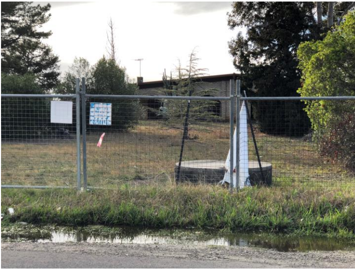
Figure 2 – Site viewed from Morshead Road

Images of the site are contained in figures 2 to 5 following: