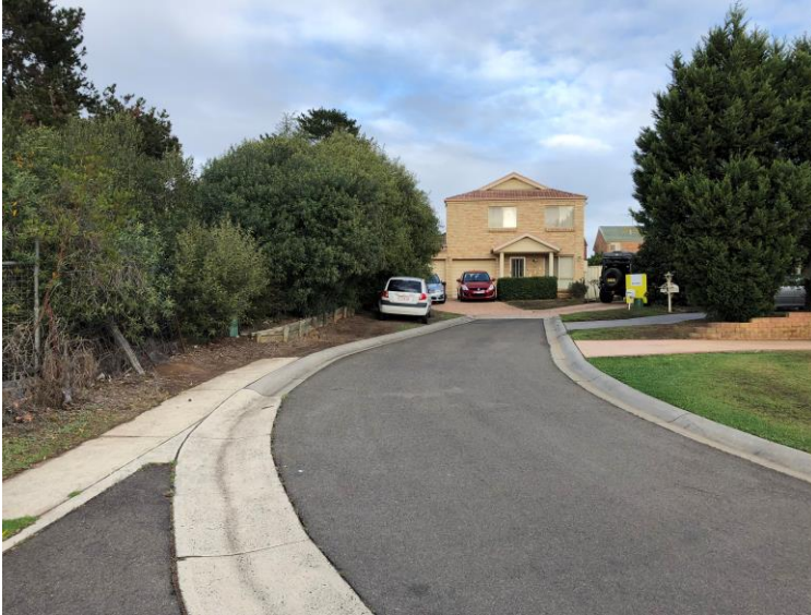
Figure 9 – Site (immediate left) viewed from Bunya Place at rear of site

Land to the immediate north, east and south is zoned R3 – Medium Density Residential with a 250sq.m minimum lot size. Dwellings in the subject locality comprise integrated housing (dwellings designed and constructed on small allotments) some of which exhibit qualities akin to a zero-lot line. In summary, the immediately surrounding residential development is of a medium density nature.