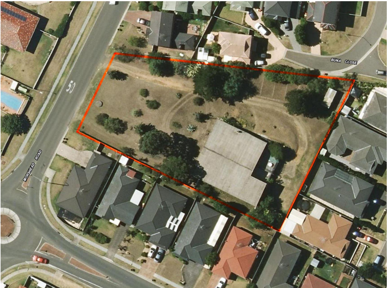
Figure 1: Subject land holding

It comprises a single residue residential allotment with a somewhat dilapidated 1960's dwelling and related improvements and generally unkempt landscape setting.