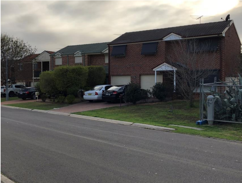
Figure 11 – Streetscape to Immediate North

The prevailing maximum permissible building height is 9.5 metres.